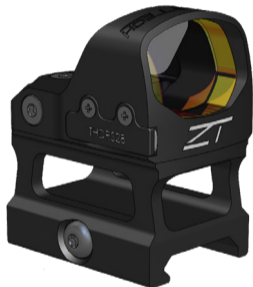
THDRS28H HIGH RISE