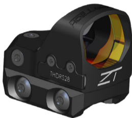
THDRS28L LOW MOUNT FOR PICATINNY RAIL FITMENT