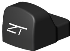
MOULDED RUBBER COVER